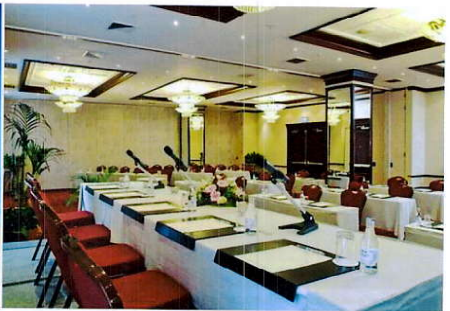
Business Moscow hotel in the city center

Ideal location on Tverskaya street for business travelers and tourists, nearby business centers and historical places of interest: Red Square and Dolshoi theater. Moscow Marriott Grand hotel is known for impeccable service and event facilities. Spacious rooms and suites offer wonderful amenities. Stay fit in Grand Fitness Gym featuring modern equipment and indoor pool. With Grand Alexander restaurant, reflecting the very best of international cuisine, Samobranka restaurant, known for Sunday brunches, grand lobby with glass dome and fountain, you will have treasured memories of your visit. Over 855sq m of event space in Moscow city center, there is no better place to host business meetings, conferences, weddings and grand social events than in Moscow Grand hotel where creative on-site and outside catering and assistance of professional event managers are set to ensure success. In 2010 and 2014 Moscow Marriott Grand got World Travel Award for The Best hotel in Russia for business meetings and conferences.